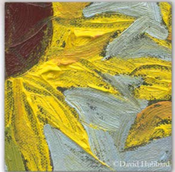
Let us capture every detail of your work of art!

And we can scan framed art, even under glass!